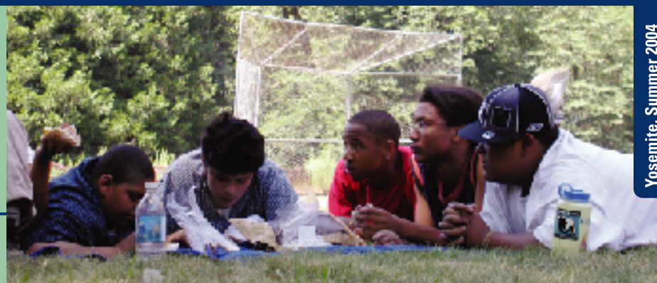
Yosemite, Summer 2004

Congratulations to our 2005 graduates! We are all so proud of you! Listed below are our graduates and the schools they will be attending in the fall: