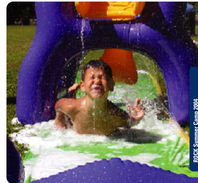
ROCK Summer Camp 2004

"ROCK is pretty amazing because it helps show kids positive ways to approach things in a way that school can't. It teaches kids what is right while at the same time allowing them to have some fun." - Dave, Volunteer