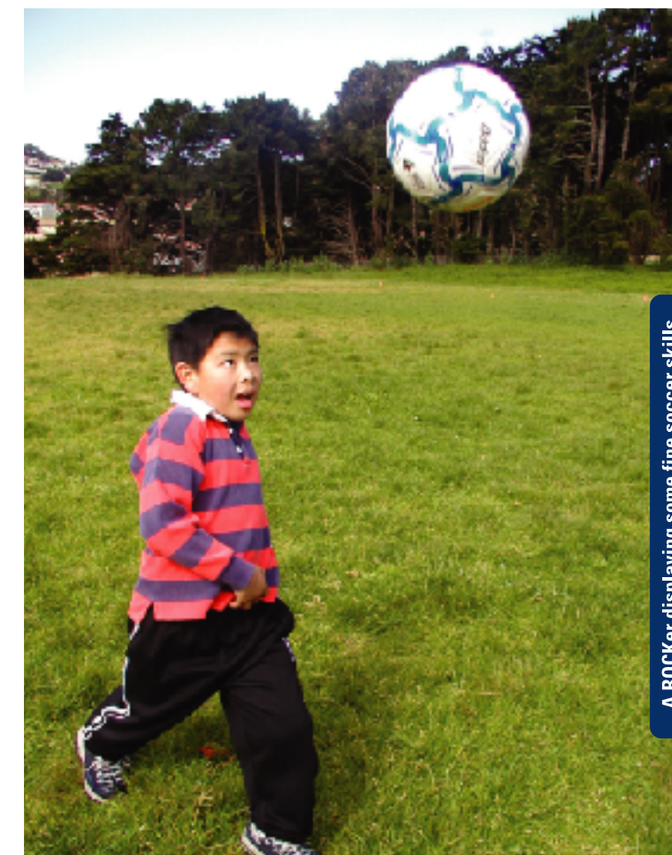
A ROCKER displaying some fine soccer skills

Join ROCK's 2005 Summer Campaign With so many new programs, ROCK needs your help more than ever. Please join us in our 2005 Summer Campaign and help us put smiles on the faces of hundreds of kids