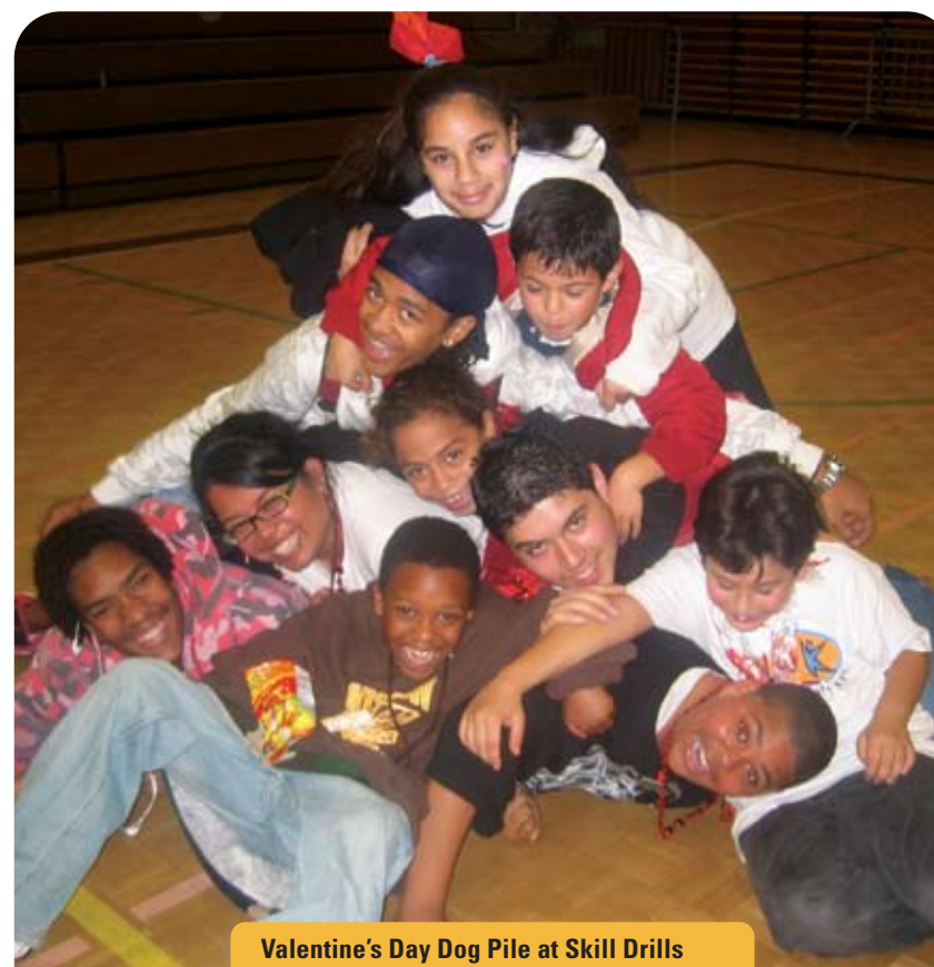
Valentine's Day Dog Pile at Skill Drills