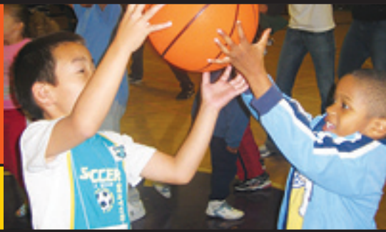
Basketball Skill Drills 2005